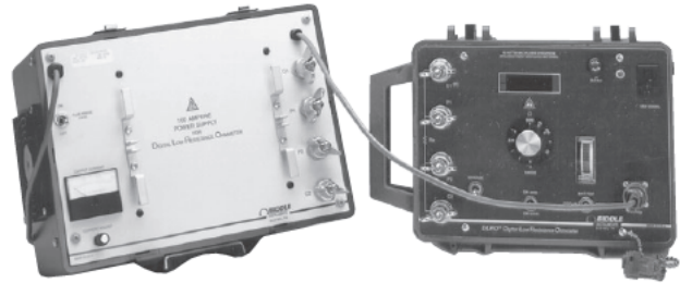
Low-Range/High-Current Model Cat. No. 247101 consists of a Single-Pak DLRO, Cat. No. 247001-3, and separate 100 ampere test current supply, Cat. No. 247120. The 100 ampere supply also may be ordered as an option.