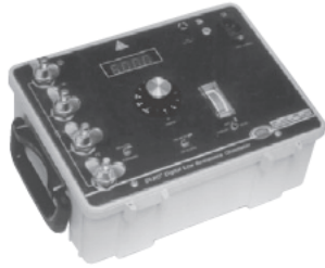
The Low-Range DLRO, Cat. No. 247002, features an extra range and rugged, Single-Pak design.